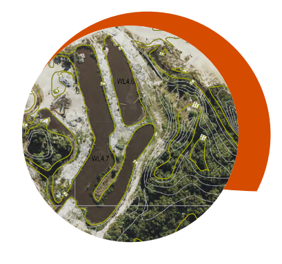
Handle and store your data securely (not in the cloud), while ensuring your data ownership.