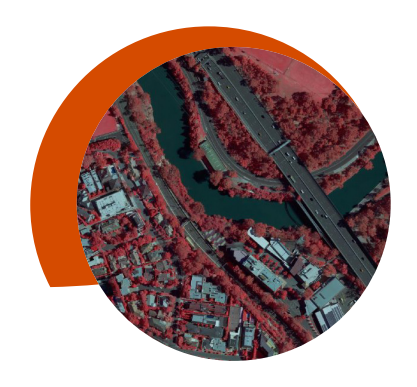
Know your needs, from wide regional surveys to high-resolution town captures.

Surveying for government clients means facing unique challenges – from meeting strict quality standards to addressing regional airspace restrictions. That's why we: