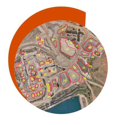
Operate within a robust framework that meets government standards and protocols.